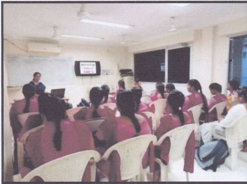
Training on Tally for B.Com Students.